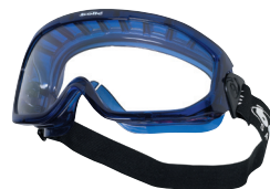
Adaptable on all BLAST models

With such a wealth of experience behind us, and our own purpose, built laboratories with established designers and technicians, our brand range of prescription safety spectacles has been carefully selected to ensure a wide choice of frames with both plastics and metals there's something for everyone, simple ordering and pricing, and our own skilled representatives who will set up your very own prescription service tailored to the specific needs of your company, who better to turn to. We have a wide range of frames that can be glazed with 3 types of prescription lenses (single vision, bifocal, progressive) and 3 different lens materials (polycarbonate, CR39 or toughened glass).